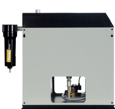
A pass-through drain niche allows easy drain access from both sides