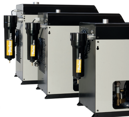
Optional pre-filter (not part of the standard scope of supply).