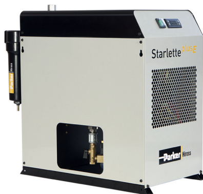
Equipped with digital controller